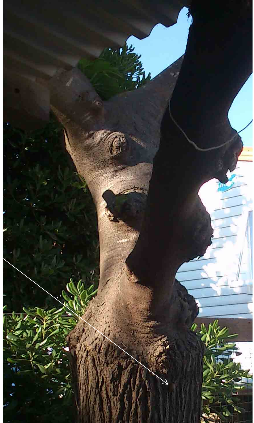
Our mulberry tree and snail