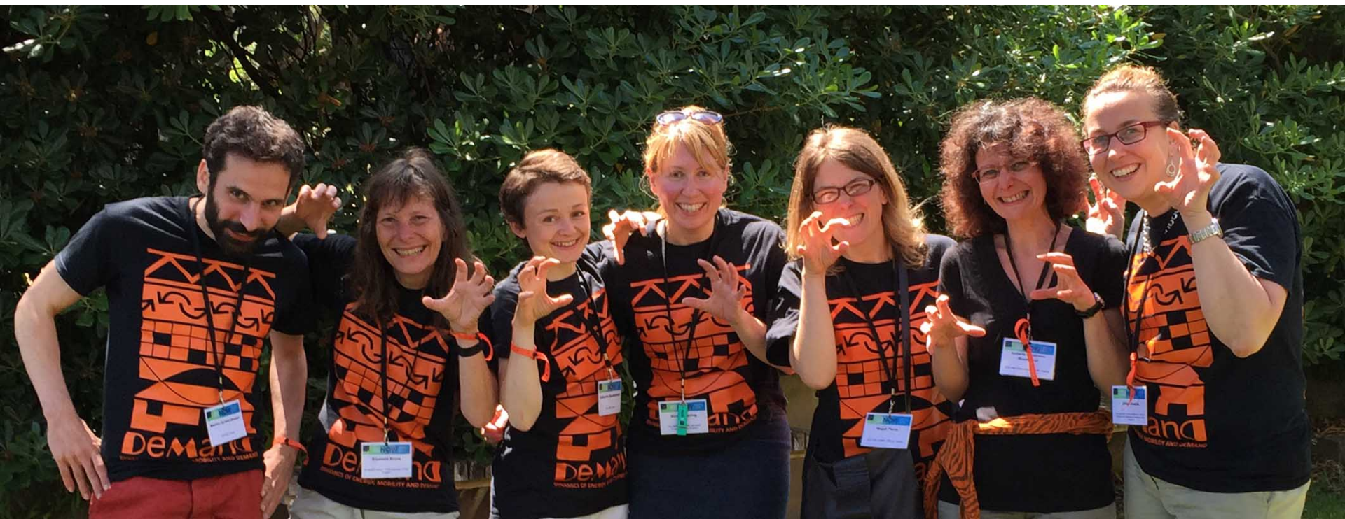
The DEMAND tigers gather